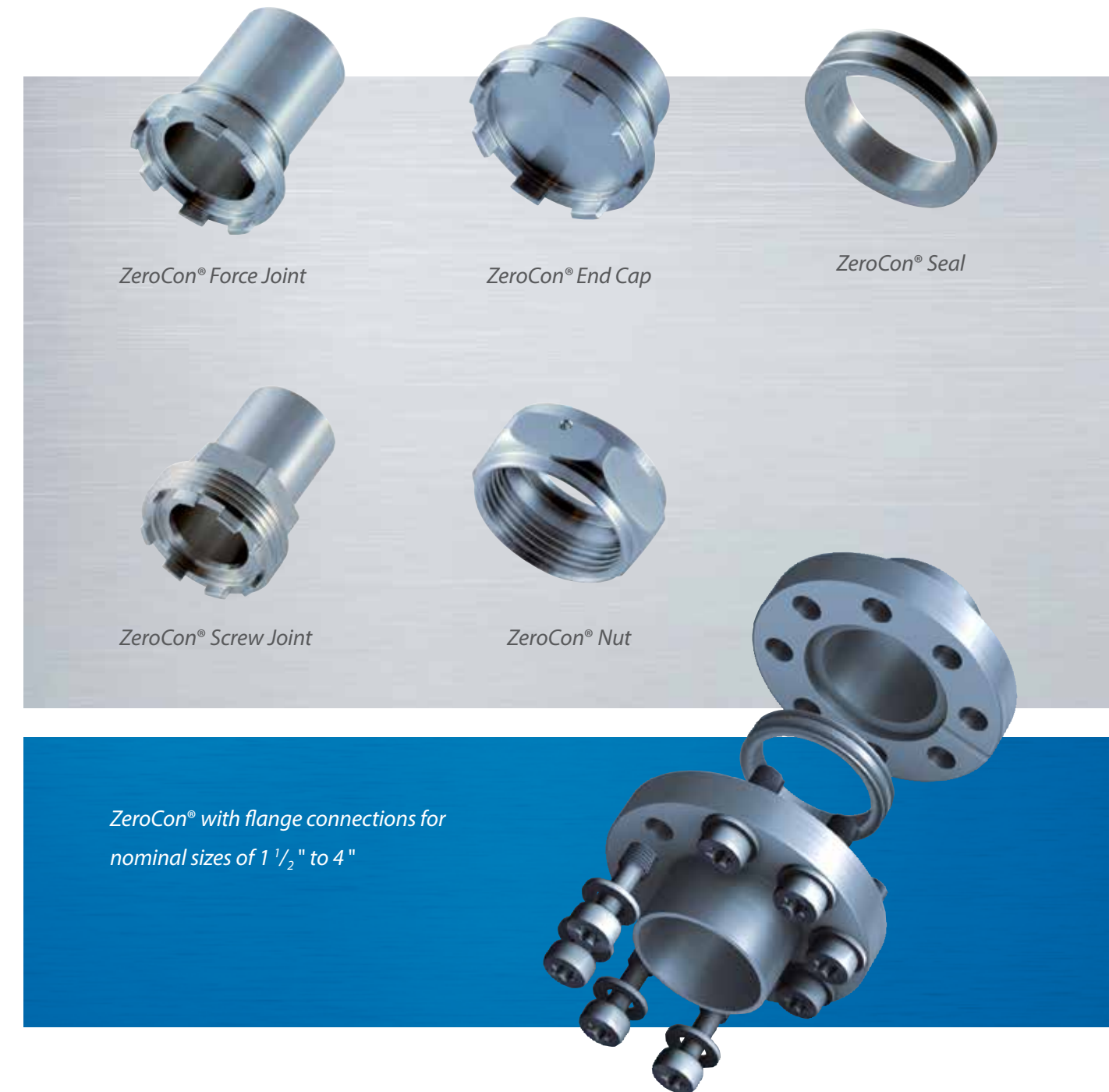
ZeroCon® with flange connections for nominal sizes of 1 1/2" to 4"

The modular design of the ZeroCon® connection means that there is nothing to stop you adding to or adapting the system at a later point. System maintenance, changes of size, and connection with further systems can be carried out rapidly, easily and cost efficient.