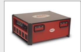
Model 501 Hot Wire Welding Power Supply

As standard, the Model 62 is configured for single wire but can be ordered for dual wire feeding for torches that have dual wire feeding guides. The addition of the Model 501 hot wire power supply will provide the best system for GTAW Hot Wire welding.